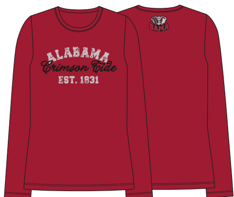
33312-2782 Alabama Foil Print Tee