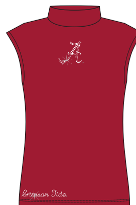
33312-2784 Alabama Cap Sleeve Tee