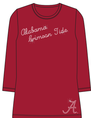
33312-2777 Alabama Tilted Script Tee