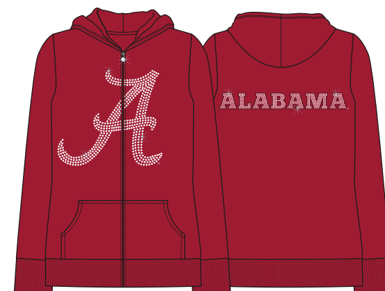
33314-2293 Alabama Rhinestone Logo Hoodie