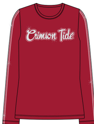
33312-2779 Alabama Lurex Team Tee