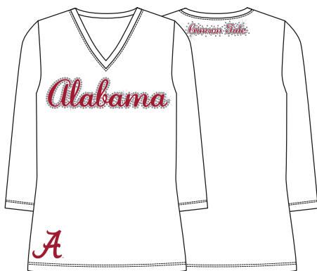
33312-2289 Alabama Rhinestone Outline Tee