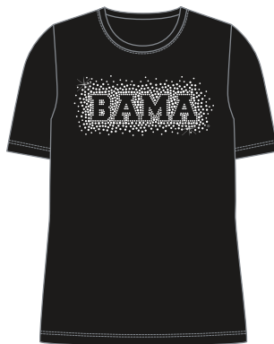
33312-2775 Alabama Reverse Rhinestone Tee