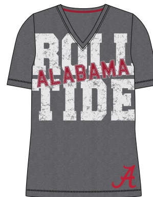
33312-2776 Alabama Printed School Tee