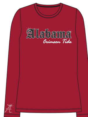
33312-2780 Alabama Old English Tee