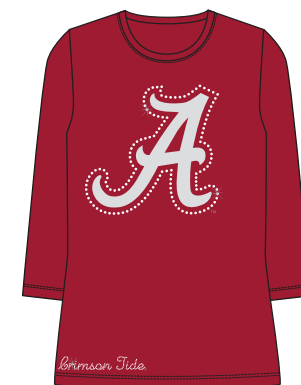
33312-2781 Alabama Sequin Logo Tee