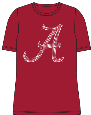
33312-2774 Alabama Bling Logo Tee