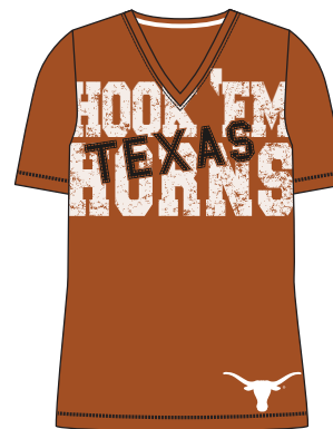
33312-2992 Texas Printed School Tee