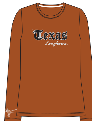
33312-2996 Texas Old English Tee