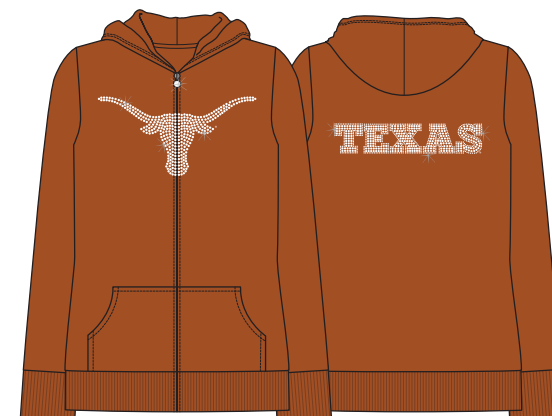
33314-2425 Texas Rhinestone Logo Hoodie