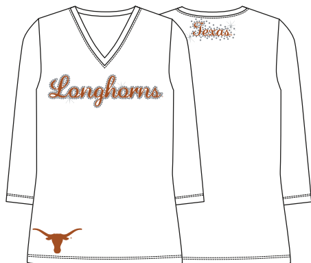
33312-2421 Texas Rhinestone Outline Tee