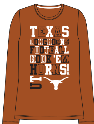
33312-2999 Texas Words Tee