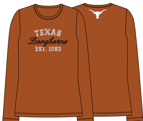
33312-2998 Texas Foil Print Tee