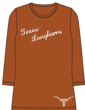
33312-2993 Texas Tilted Script Tee