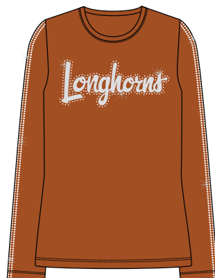
33312-2995 Texas Lurex Team Tee