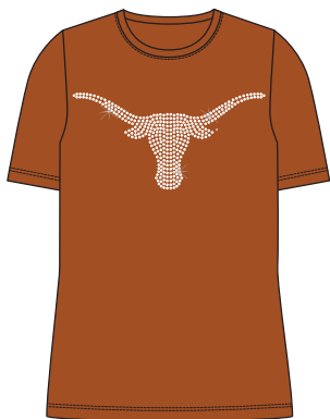
33312-2990 Texas Bling Logo Tee