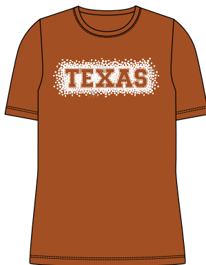
33312-2991 Texas Reverse Rhinestone Tee